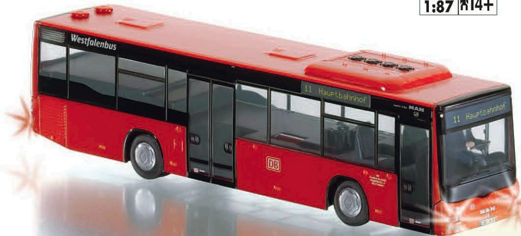
0774 26 MAN Lion's City A78 - DB

WIKING CONTROL87 has got a new addition: The MAN Lion's City joins the range as a new 1:87 model with high-end technology on board and a system that model enthusiasts can configure themselves – thanks to