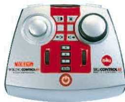
0774 10 Fernbedienung